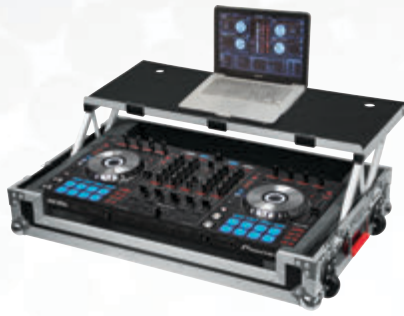
Tour Style Case Designed to Fit the Pioneer DDJ-SX, DDJ-SX2 & DDJ-RX Controller