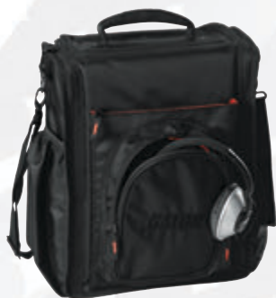
Bag for Small CD Players or 10" Mixers Model# G-CLUB CDMX-10