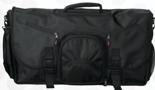
Large Messenger Bag for DJ Style Midi Controllers up to 25" Length