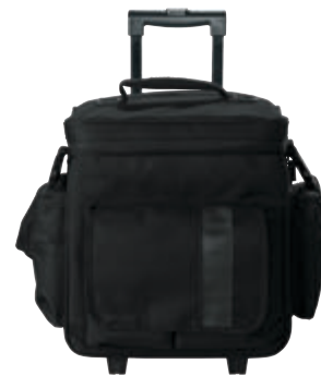
Carry Bag for 35 LPs and Serato-Style Interface Model# G-CLUB-DJ CART