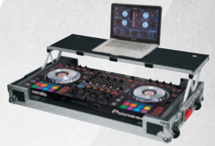
Tour Style Case Designed to Fit the Pioneer DDJ-SZ & DDJ-RZ Controller