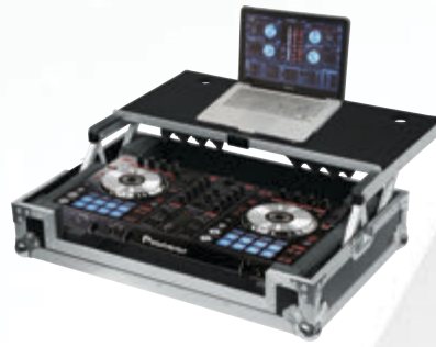
Tour Style Case Designed to Fit the Pioneer DDJ-SR Controller