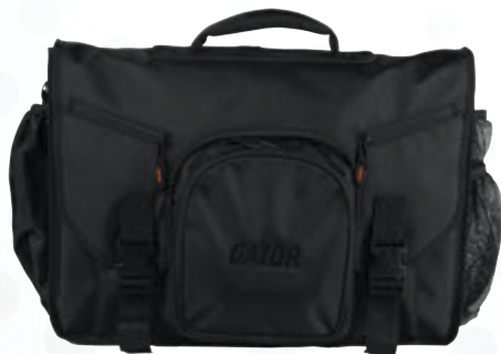
Messenger Bag for DJ Style Midi Controllers Up to 19" Length