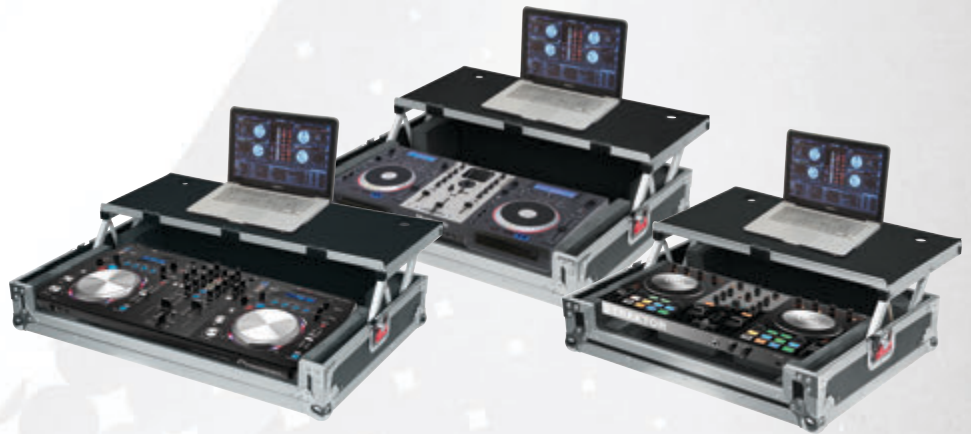
Tour Style Case Designed for Large, Medium, and Small DJ Controllers