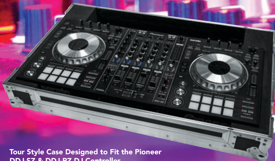
Tour Style Case Designed to Fit the Pioneer DDJ-SZ & DDJ-RZ DJ Controller Model# G-TOUR DDJSZ