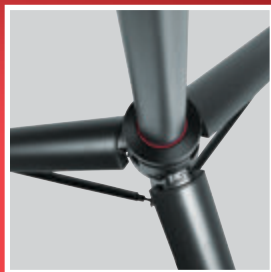
3rd Leg Adjusts for Leveling on Uneven Surfaces