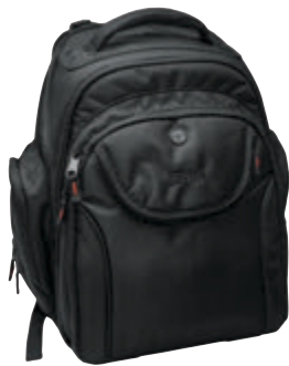
Large Size G-Club Backpack Model# G-CLUB BAKPAK-LG