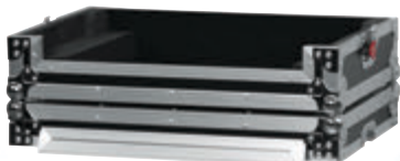
Tour Style Case Designed To Fit the Numark NS7II DJ Controller