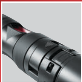
Easy One-Handed CAM Operation