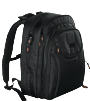
Small Size G-Club Backpack Model# G-CLUB BAKPAK-SM