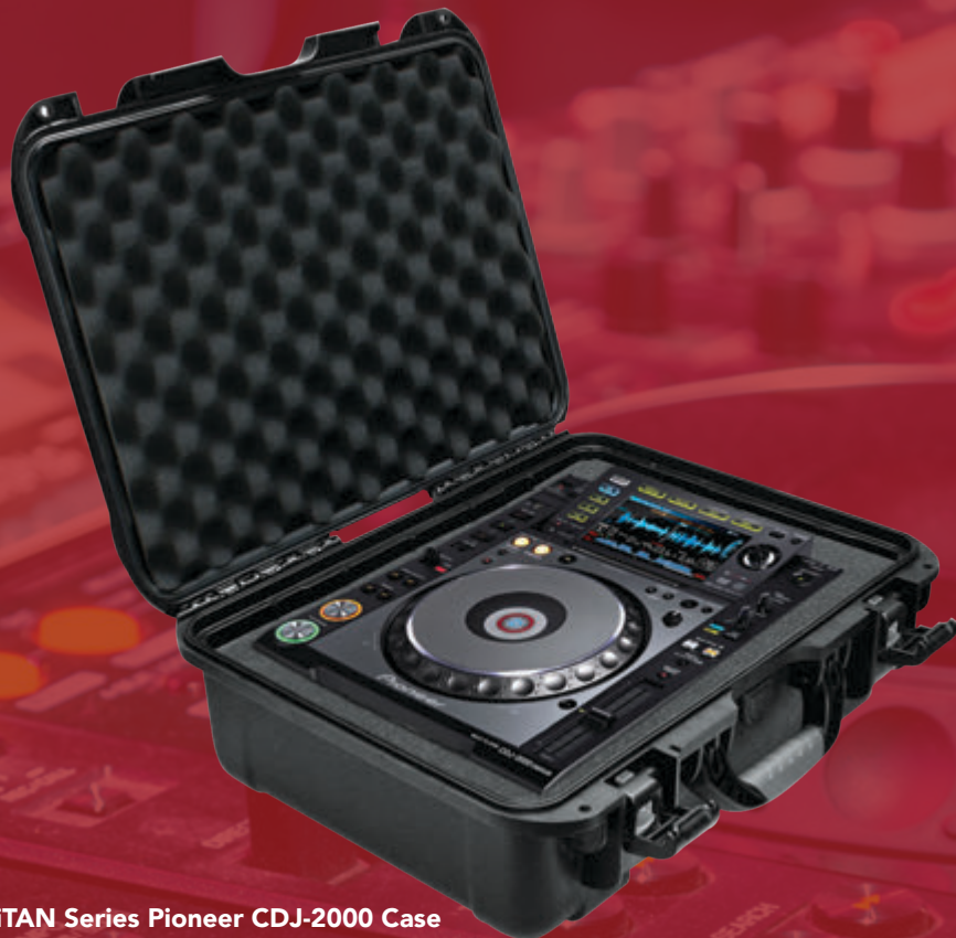
TITAN Series Pioneer CDJ-2000 Case Model# G-CD2000-WP