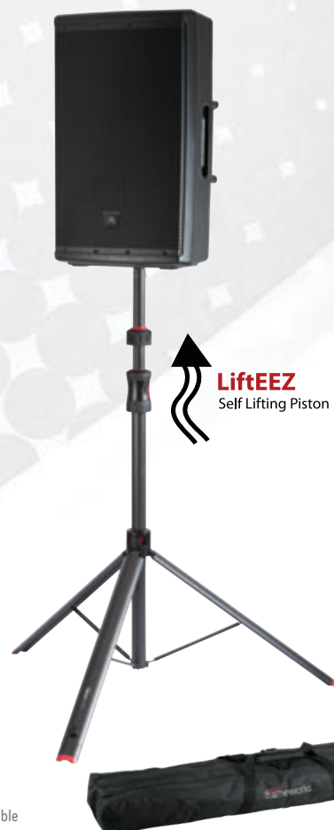
LiftEEZ Self Lifting Piston