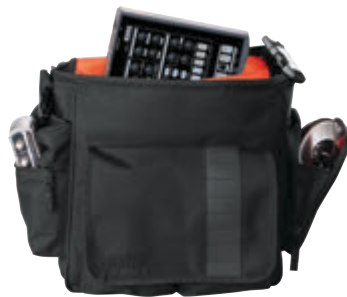
Carry Bag for 35 LPs and Serato-Style Interface Model# G-CLUB-DJ BAG