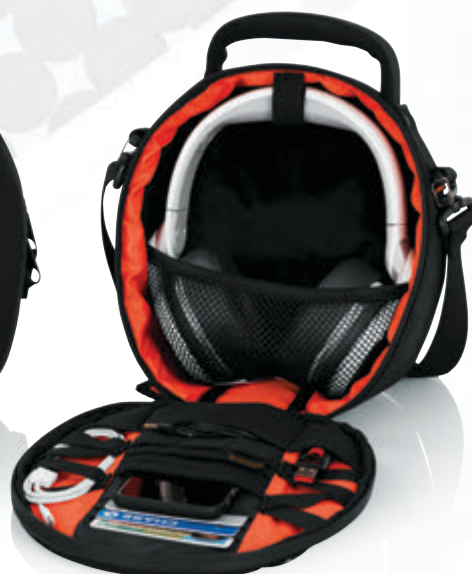
Headphone Case Model# G-CLUB-HEADPHONE