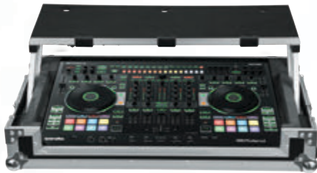
Tour Style Case Designed to Fit the Roland DJ-808 Controller