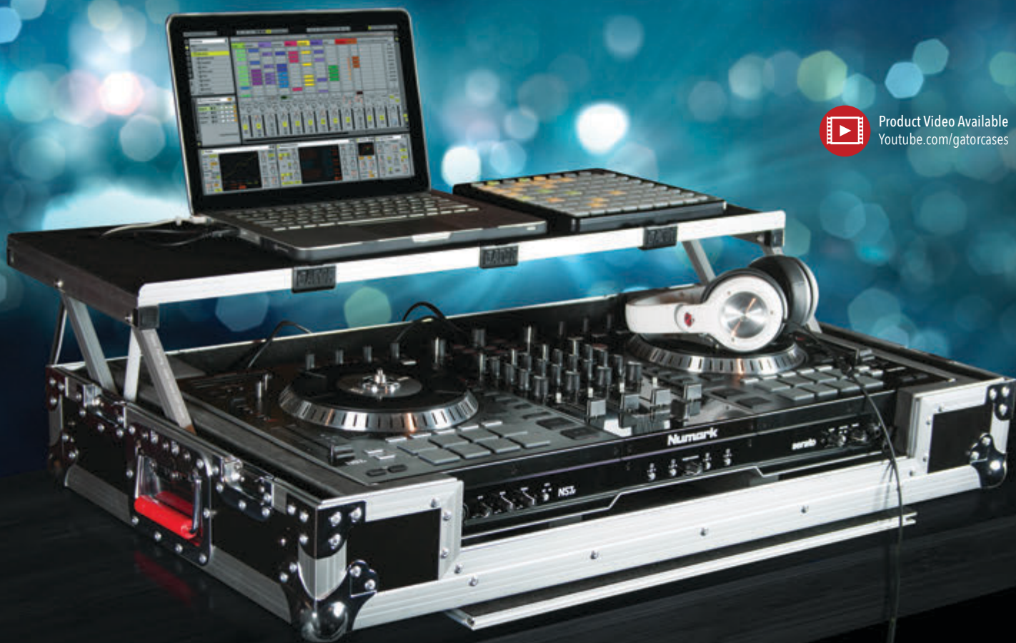
Tour Style Case Designed to Fit the Numark NS7II Controller Model# G-TOURDSPNS7II

Product Video Available Youtube.com/gatorcases