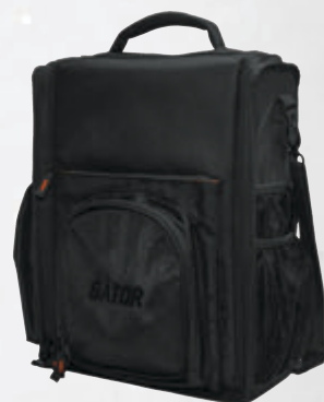
Bag for Large CD Players or 12" Mixers Model# G-CLUB CDMX-12