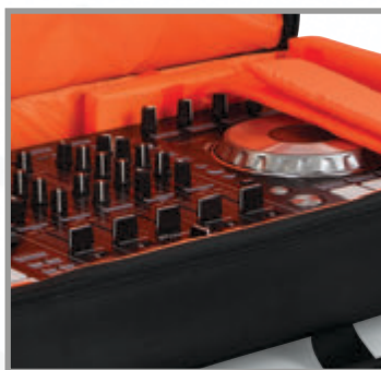
Padded Interior with Adjustable Straps and Pads Keep Your Gear Secure